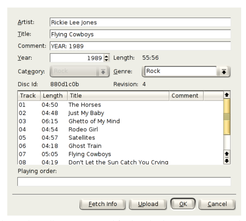
The CD Database Editor allows you to modify, download, save, annotate, and upload CDDB (Compact Disc Data Base) entries.

If there is an entry in your local CDDB tree (see the CDDB subsection in the Configuration chapter) for the CD in your CD-ROM drive, or if the disc could be found in the freedb, you will see the name of the artist and the title of the CD in the Artist : and Title fields and a list of tracks with song titles in the Tracks selection box. Otherwise, you will see a list of tracks and play times without titles